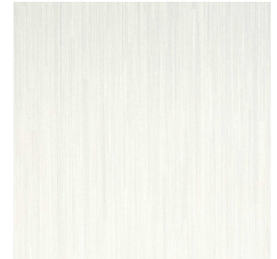
Sahara Silk Wallpaper