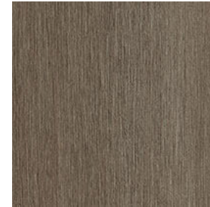
Phantom Cocoa Laminate