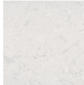
Cambria Weybourne Quartz

Our agile manufacturing process means we can work with any material.